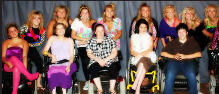
COULD IT BE ANY MORE FUN THAN THIS?

Thursday, August 11 through Sunday, August 15 Camp Tawakoni, near Augusta