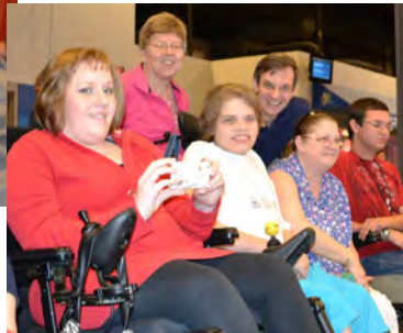
The FUSE visit brought good luck to the WILD with a big win over Amarillo.